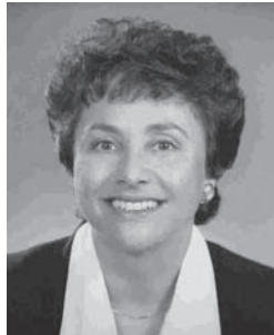
Congresswoman Nita M. Lowey Proudly Serving New York's 18th Congressional District